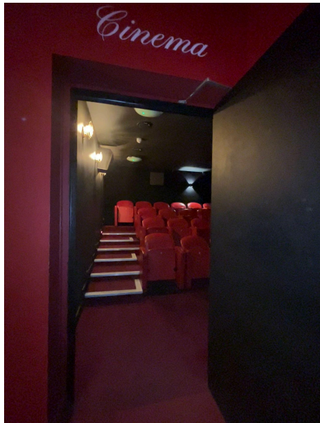
Cinema door open

This door is 37 inches wide and is a pull. This door remains open during admissions prior to screenings.