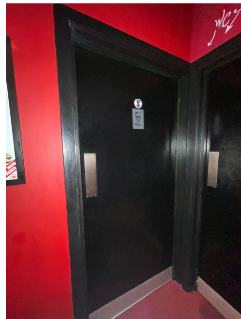
Outside bathroom door closed