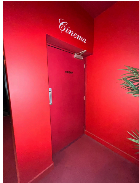
Cinema door closed