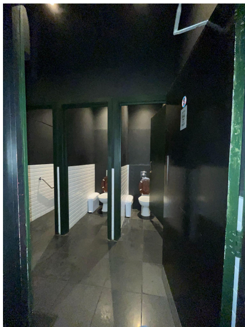
Outside bathroom door open

This door is 32.5 inches wide and is a push door. There are three cubicles inside these toilets with 28 inch wide push doors.