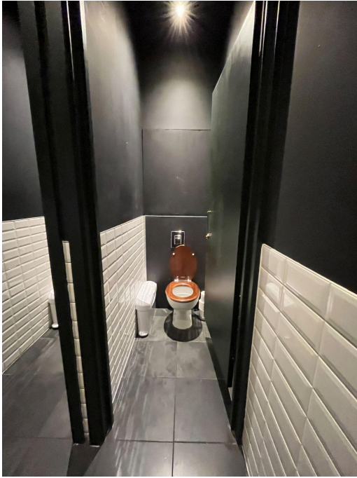
Cubicle door open