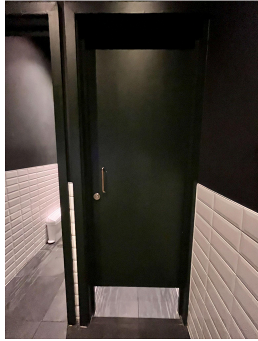
Cubicle door closed